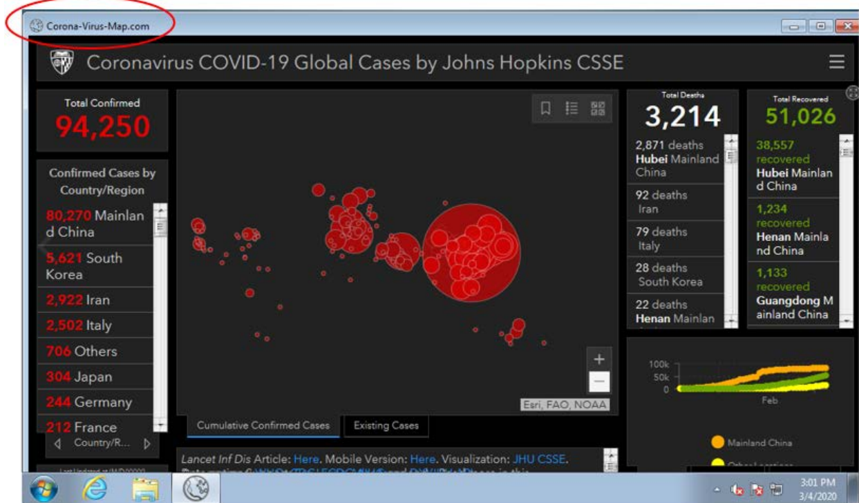
Figure 1. Screenshot of the malicious website "Corona-Virus-Map[dot]com" pretending to be a legitimate COVID-19 tracker.